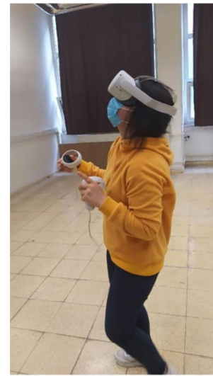
Figure 2. The Moment of Students Experiencing the Virtual Reality Application.

The scale was developed by Witmer et al. [21] in 2005