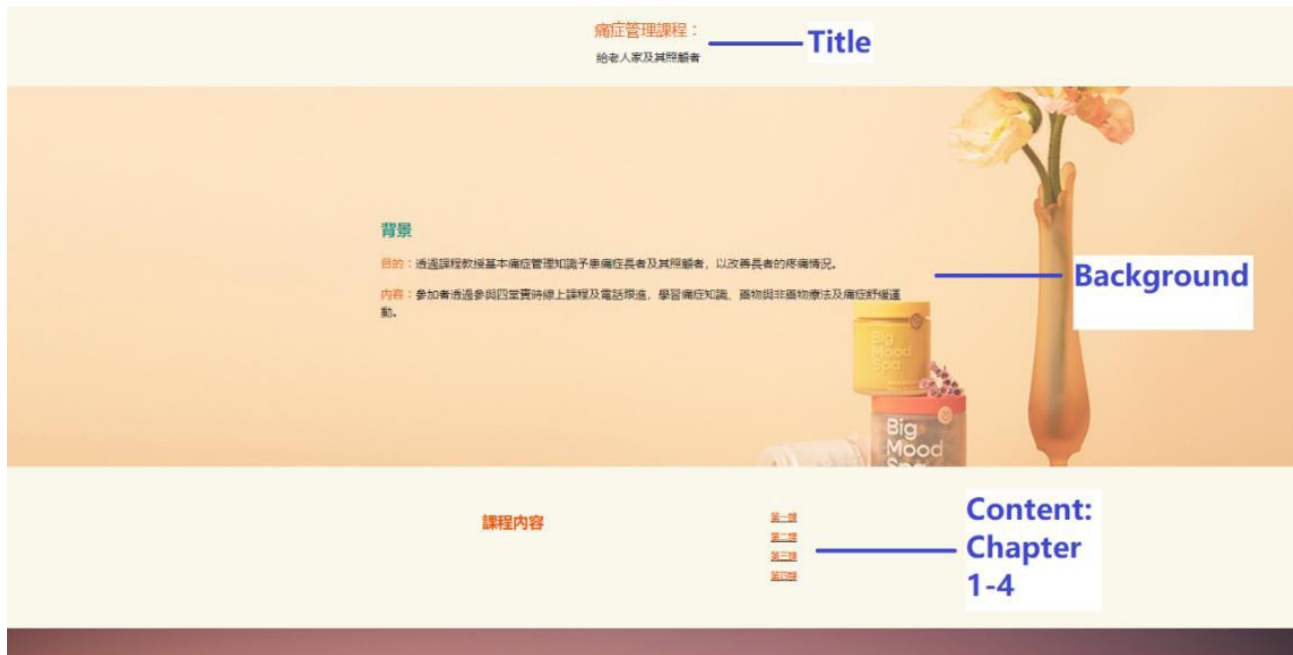
Figure 1. The Home Page of PMP Online Learning Platform.