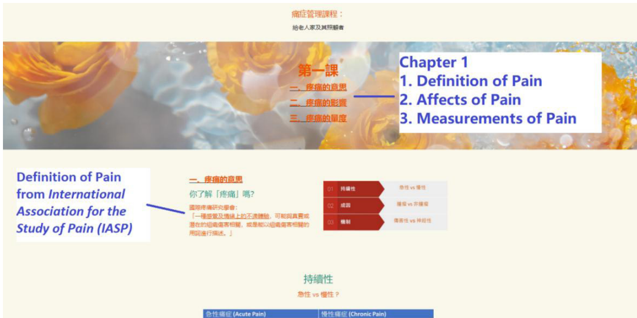
Figure 3. Chapter 1 - Learning material of PMP online learning platform.