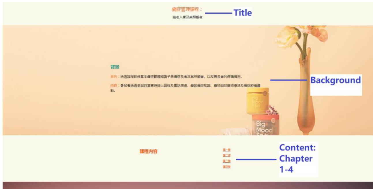
Figure 1. The home page of PMP online learning platform.